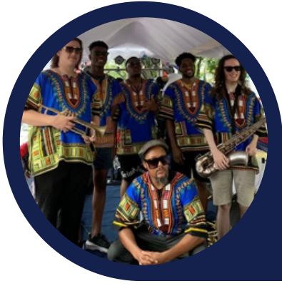
Students from the Jazz Ambassadors Band perform in Limon, Costa Rica, on a Carnival float with US Ambassador.