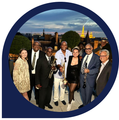
We brought an all-star jazz band to Paris for Fete de la Musique to accompany Jon Batiste.