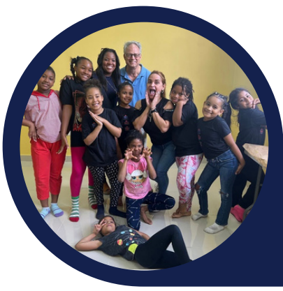
Visiting with students at Escuela de Bella Artes in San Cristobel, Dominican Republic.