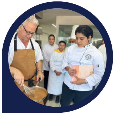
Jazz International staff demonstrates the preparation of gumbo and sazeracs for students at the Instituto de Gastronomía ISIMA in Merida, Mexico